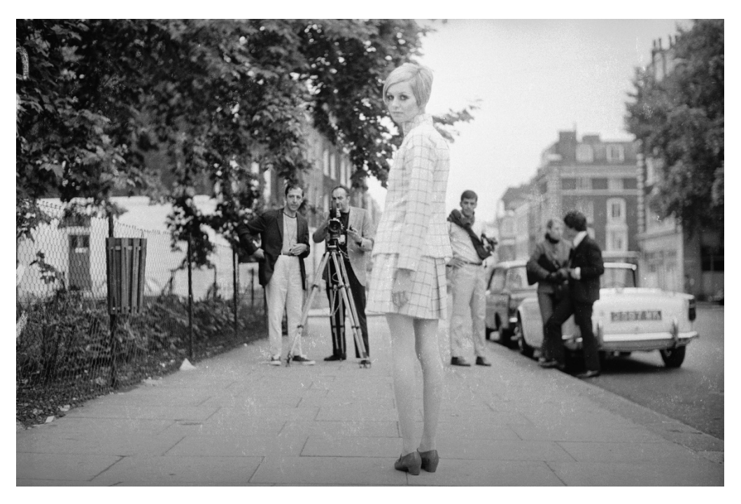
Miniskirt (Bourne, 2015)