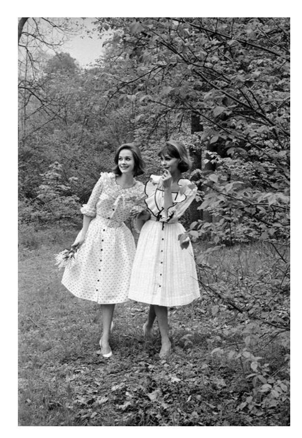
Vintage (George, 2018)